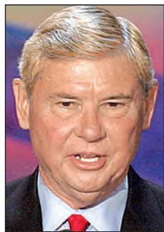
Graham Former U.S. Senator and Florida governor to receive 2006 Woodrow Wilson Award for Public Service.

Former U.S. Senator and ex-Florida governor Bob Graham will get the 2006 Woodrow Wilson Award for Public Service. Graham's 2004 book, Intelligence Matters , is about his role in the Senate's investigation of terrorist attacks on Sept. 11, 2001.